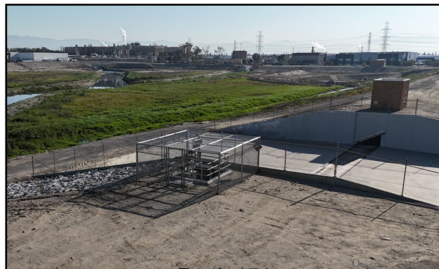
Page 151 Outlet Control Gate/Rubber Dam System