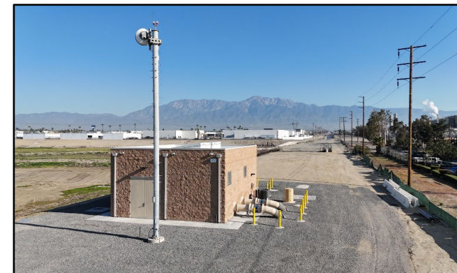
Control/Pump Station Building